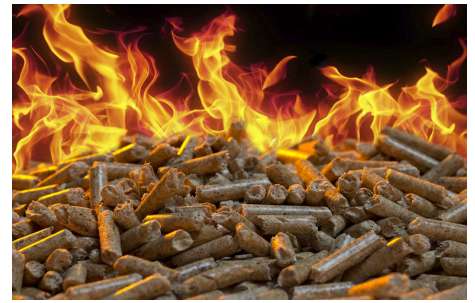
Wood pellets: Sawdust pressed into small energy bundles that burns cleanly and evenly in the pellet heating system.