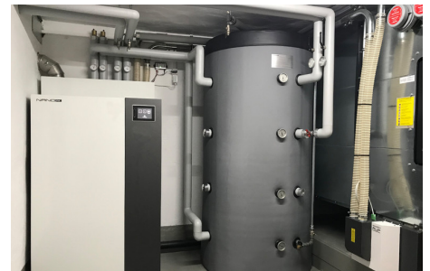
Pellet boiler (left) and buffer tank in a two family building.