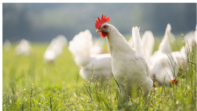
Soy is an important ingredient in feed for laying hens.