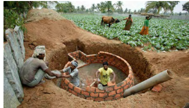
India Building biogas digesters