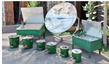
Madagascar Solar cookers and efficient cookers