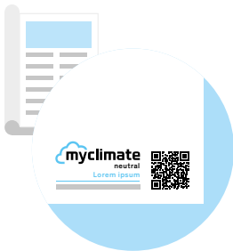
Label with tracking number