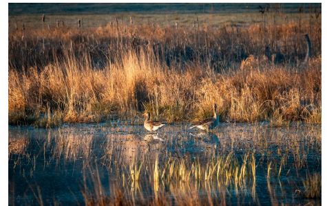
... or greylag geese, who happily breed in wetlands...