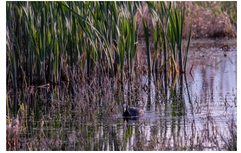
The moor also provides an important habitat and shelter for other birds, such as the coot with its bright white crest above its beak...