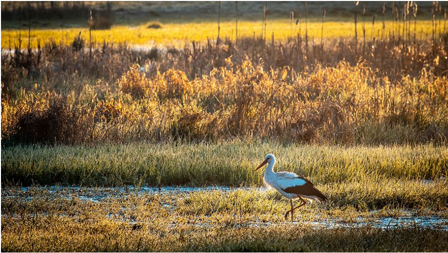
Here a white stork can be seen wandering through the wet soil, looking for earthworms, insects and frogs.

Thanks to this carbon offset project, the Gelliner Bruch moorland in Mecklenburg-Western Pomerania can be restored to its natural state. This will result in a significant decrease in the quantity of greenhouse gases emitted into the atmosphere. However, it's not just the climate that will benefit but biodiversity, too, especially the local bird-life, since marsh and wetlands are crucial areas for them to shelter and breed in.