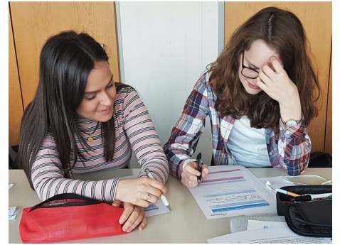
What can we do? Workshop on sustainable travel opportunities.