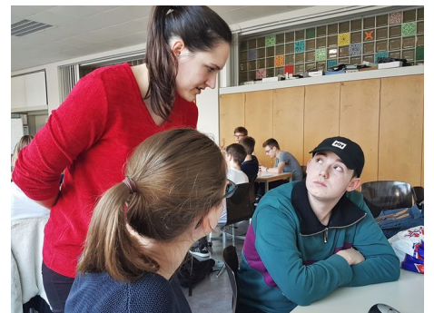
myclimate in the classroom - discussion on "sensible travel"