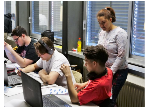
Exchange between the students.