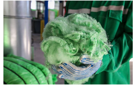
Among other things, polyester fibres made from recycled PET bottles are used in textile production.