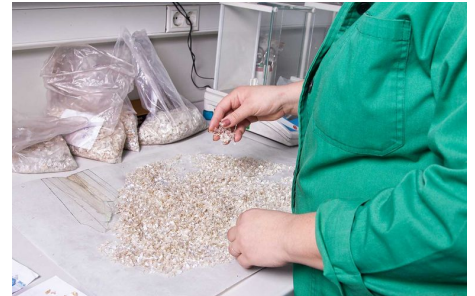
Laboratory check.