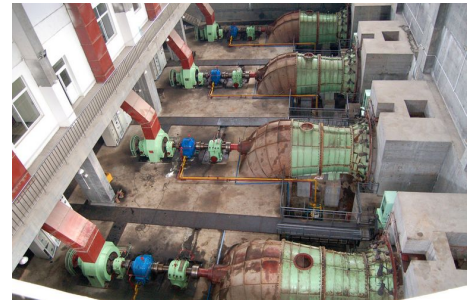
The four turbines inside the power station. Technical rooms can be seen on the left side.