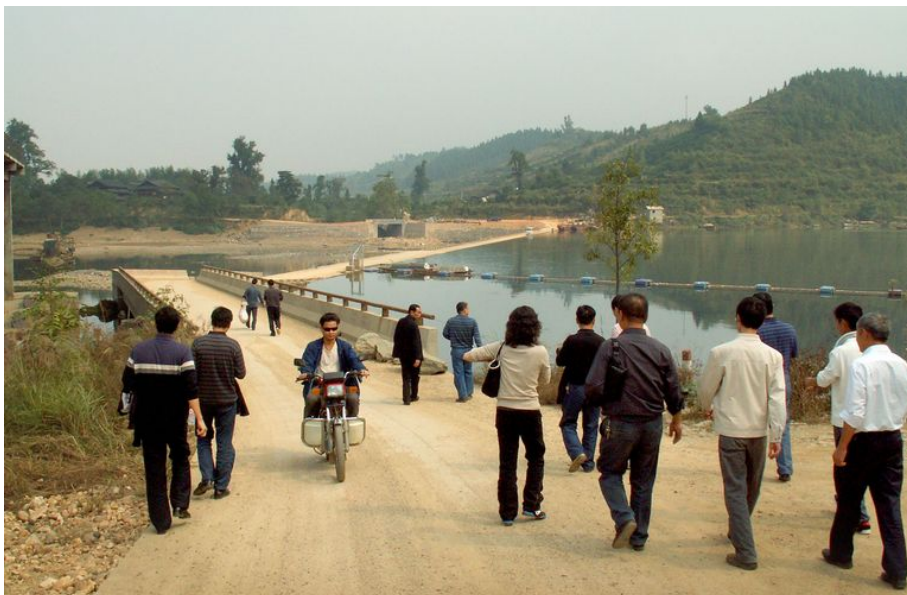
The project creates local jobs.

In the southwest of China, four small run-of-river power plants are being constructed. The clean power generated is fed into the power grid and replaces power from the combustion of fossil fuels. At the same time, the project creates local jobs.