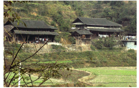
The project is located in a county in a mountainous region where 16 ethnic minority groups live. 61% are Miao and Dong people.

And have a look at more pictures on myclimate-Facebook!