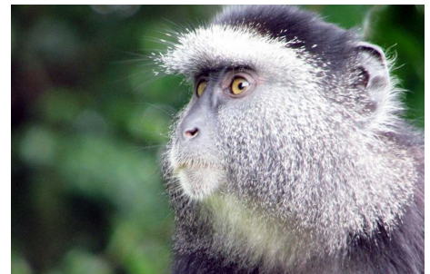
Blue Monkey: One of seven species of primates found in Kakamega forest that is threatened with extinction as the forest becomes smaller.