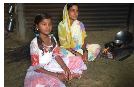
Sept 2017: Before they had to cook on a simple cook stove and collect firewood. Cooking with biogas is now faster and cleaner.