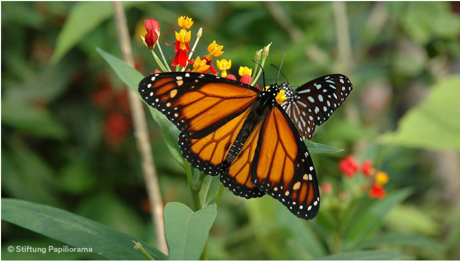
Monarch butterfly (Danaus plexippus) at Papiliorama.

This climate protection project makes it possible for the tropical garden at Papiliorama, which is unique to Switzerland, to be heated efficiently in future. The connection to a renewable district heating network helps to reduce the CO 2 emissions caused by heating at this popular attraction.