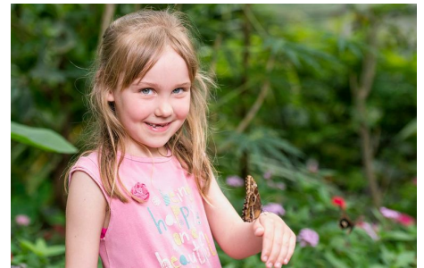
A young visitor to Papiliorama with a butterfly.