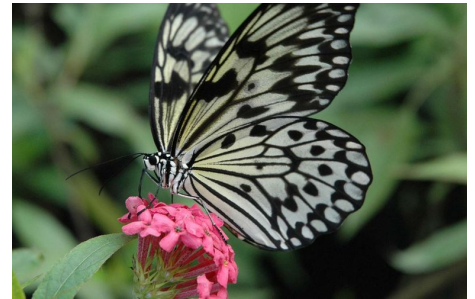
Large tree nymph (Idea leuconoe) at Papiliorama.