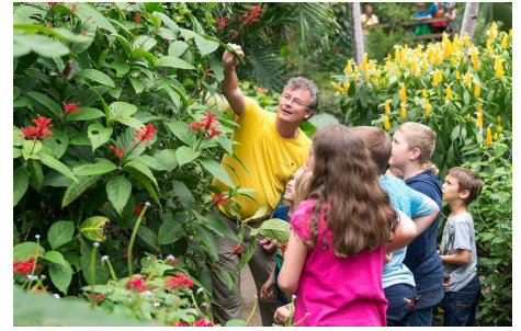
Zoo educator with young visitors at Papiliorama.