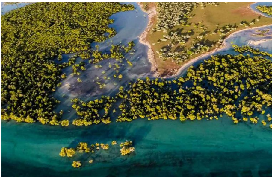
Mangrove forests at the coast of Myanmar are important carbon sinks and rich in biodiversity and seafood resources.

The project engages the local population of a coastal region in Myanmar to restore degraded mangrove ecosystems. The aim is to create healthy mangrove forests that take up carbon, protect the population from natural disasters and conserve biodiversity by representing a key habitat for endangered species. At the same time, the project aims at diversifying livelihoods of local communities and increasing their well-being.