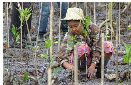
Reforested mangrove forests protect local population from extreme weather events.