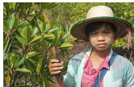
Planting mangrove seedlings. The project has a special focus on supporting women and girls.