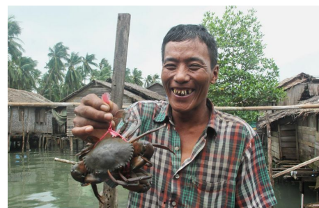
Fishermen happy with better catches