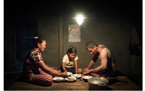
More family time: Cooking with biogas saves the time-consuming collection of firewood.