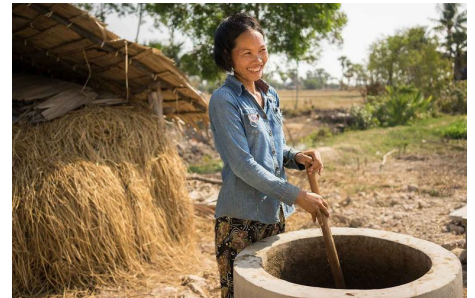
The programm helps to strengthen the position of women and children within the family and the society.