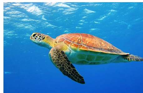
Green turtle: Classified as endangered.