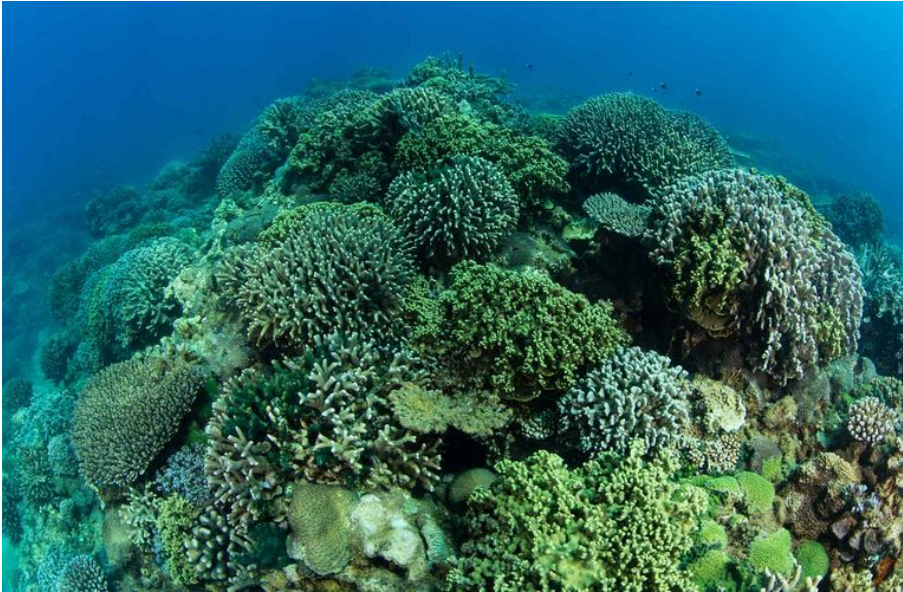
When coral reefs are preserved, habitats for endangered species are protected.

This carbon offset project fosters sustainable use of mangroves, or “blue forests”, to avoid deforestation and degradation. Healthy, intact mangrove forests take up carbon, protect the population from natural disasters and help conserve coral reefs - a key habitat for endangered species.