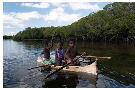
The mangrove forests in the Bay of Assassins are home to approximately 3'000 people.

4,000 coastal people – 60% of whom live below the national poverty line – benefit from social investment that increases their income and well-being.