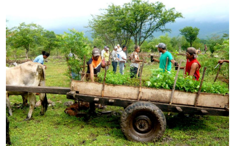
Loading the card with seedlings: Each rainy season, entire villages come together to plant hundreds of thousands of trees.