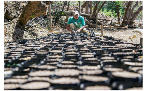
One of the projects nurseries for growing thousands of seedlings.