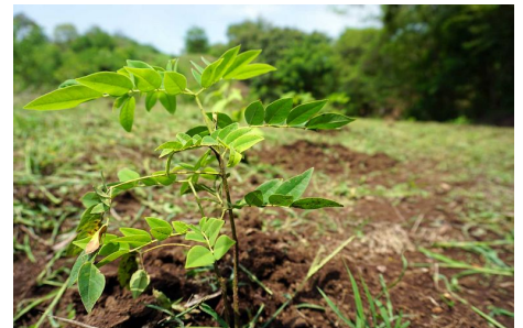
A newly planted tree having been moved from nursery to farm.