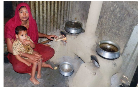
Mother and child: Cooking is cleaner and faster.

This project contributes to 8 SDGs (as of end 2021):